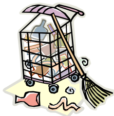
Time to do last minute clean up before cold weather!!

Don't forget to bring a non perishable item to donate to the Food Bank!!